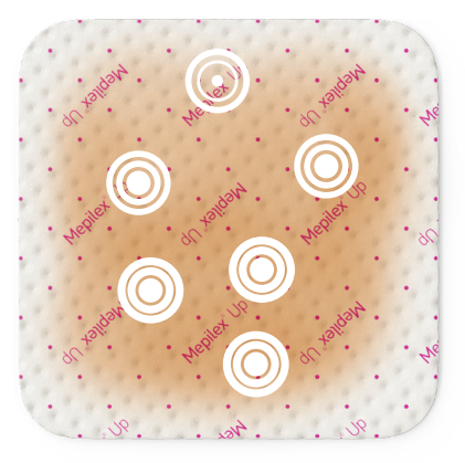
The innovative and unique spreading properties minimize the risk of leakage and may contribute to long wear time and fewer dressing changes"