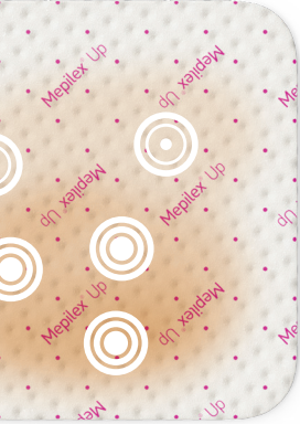
The dimpled pattern enables the dressing to spread fluids evenly in all directions, even against gravity

Mepilex<sup>®</sup> Up is a new kind of non-bordered foam, intentionally designed to help reduce leakage and prevent its spread to healthy skin. Its unique, proprietary dimpled surface pattern handles fluid better than other foam dressings, even against the effects of gravity.